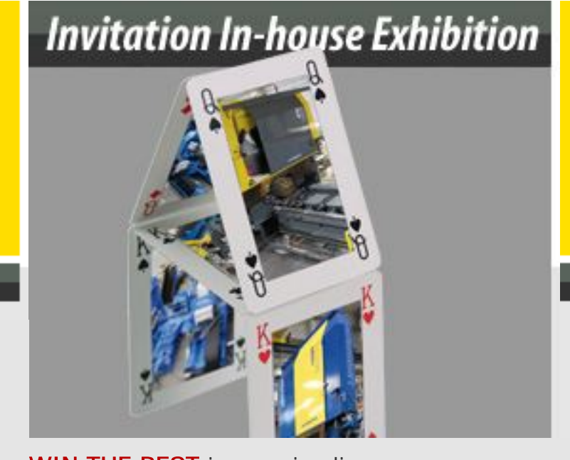
WIN THE BEST impression live.