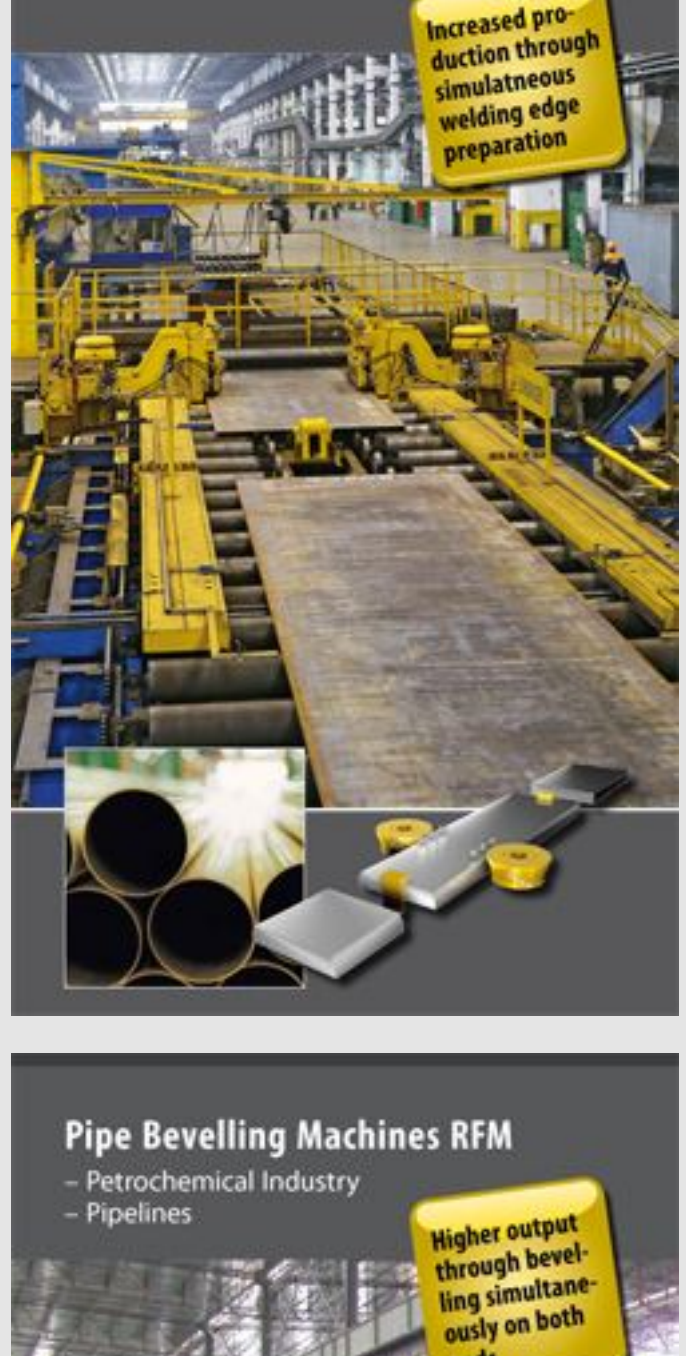
Plate edge milling machine PFM - Large tube mills